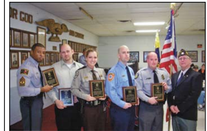
Annual Public Service Dinner

Asheville Post 526 was the recipient of clothes and food donated by Lincolnton Post 30 and Hickory Post 48. Post 30 brought a truck completely filled with clothes and food while Hickory 48 brought a SUV with the back full of clothes. Post 526 is in need of good quality clothing for the homeless veterans.