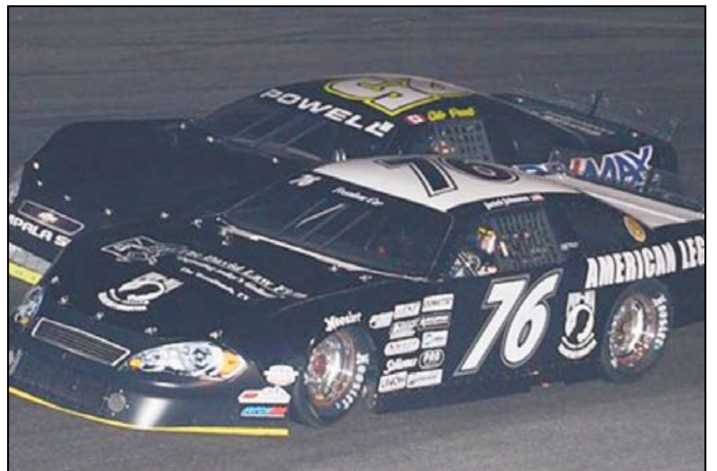
February 20