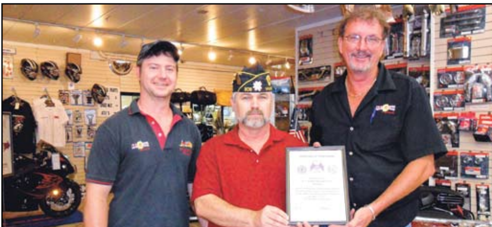
American Legion Post 208 Awards Local Businesses For Contributions