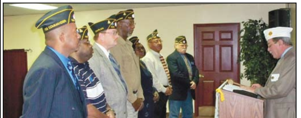
Officers Installed at Asheville Post 526

On June 11th the American Legion, William Johnson Post 534 in Eden held its annual Family Spring Fling Day. There was plenty of FUN and FOOD for all to enjoy. The Post used this as a recruiting tool and gained two new members from the event.